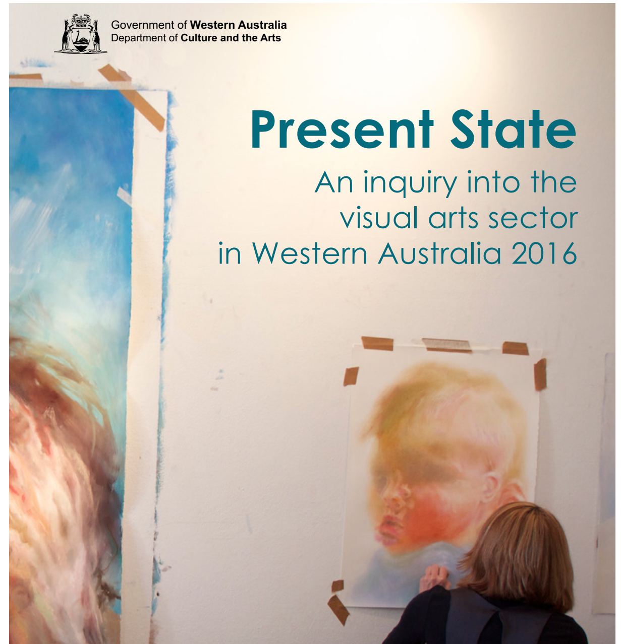
Image credit: Fremantle Art Centre, Artist in Residence, Lacey McKinney, 2013 . Image courtesy Fremantle Art Centre

Encouraging Excellence: Building capacity